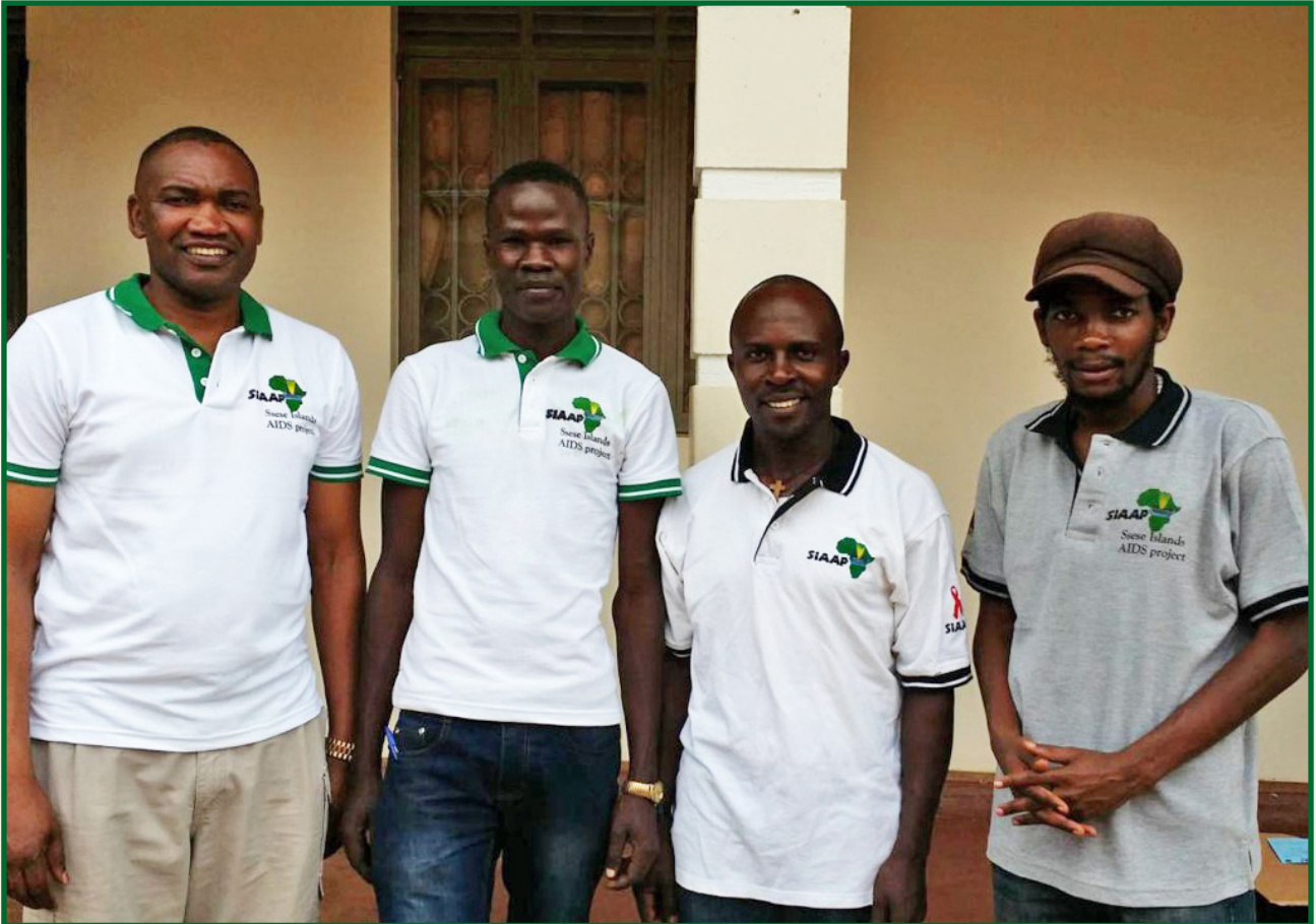
SIAAP staff and volunteers with SIAAP President.