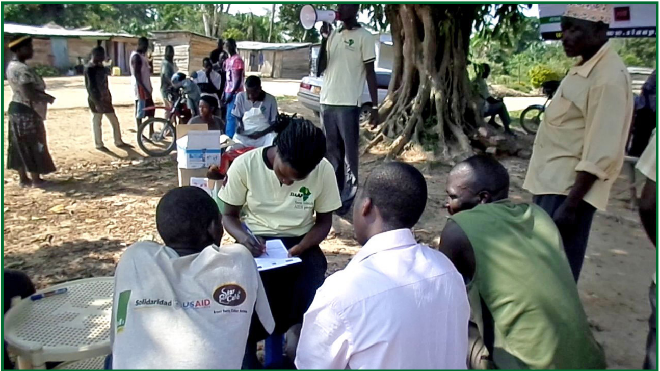
SIAAP HIV Community Outreach