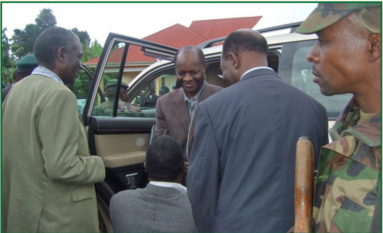
Ssabasajja Kabaka visits SIAAP, OCT 2012