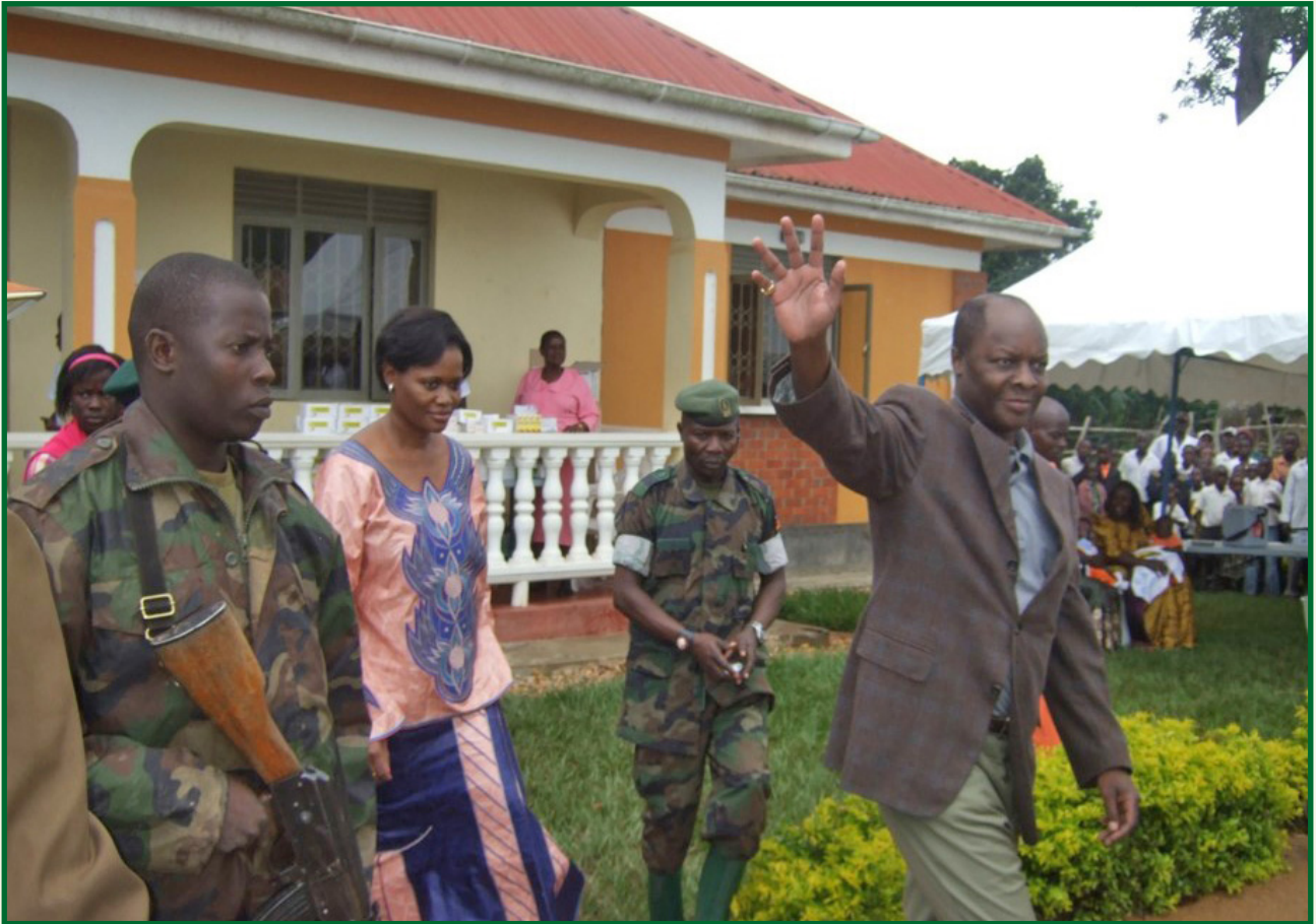
Ssabasajja Kabaka visits SIAAP, OCT 2012