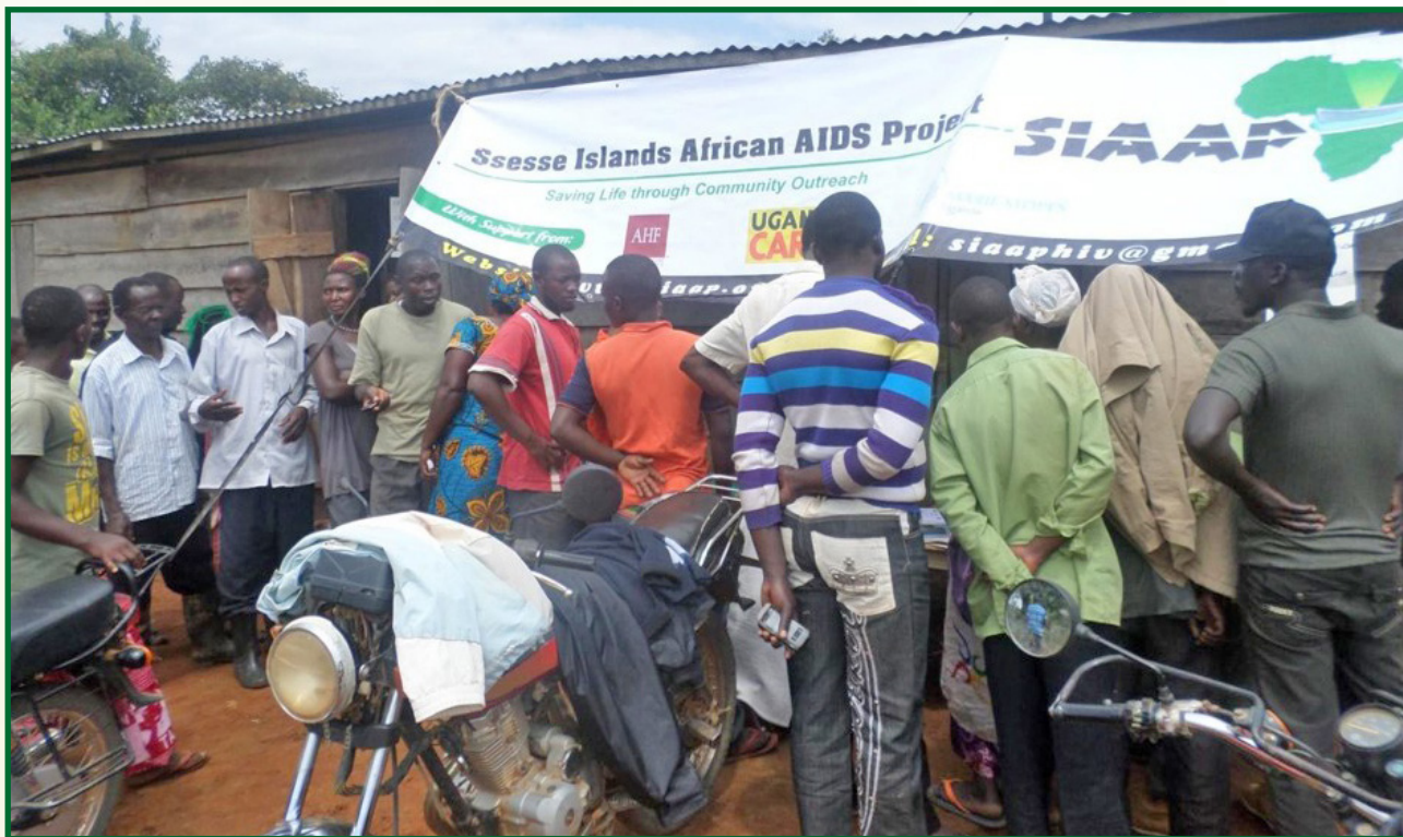
Clients registering for HCT at an outreach