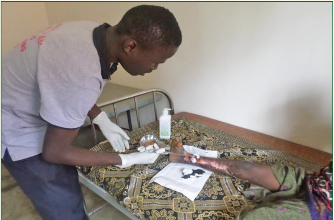
Treatment at SIAAP