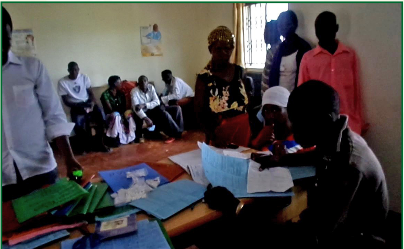
Sensitization at SIAAP Headquarters