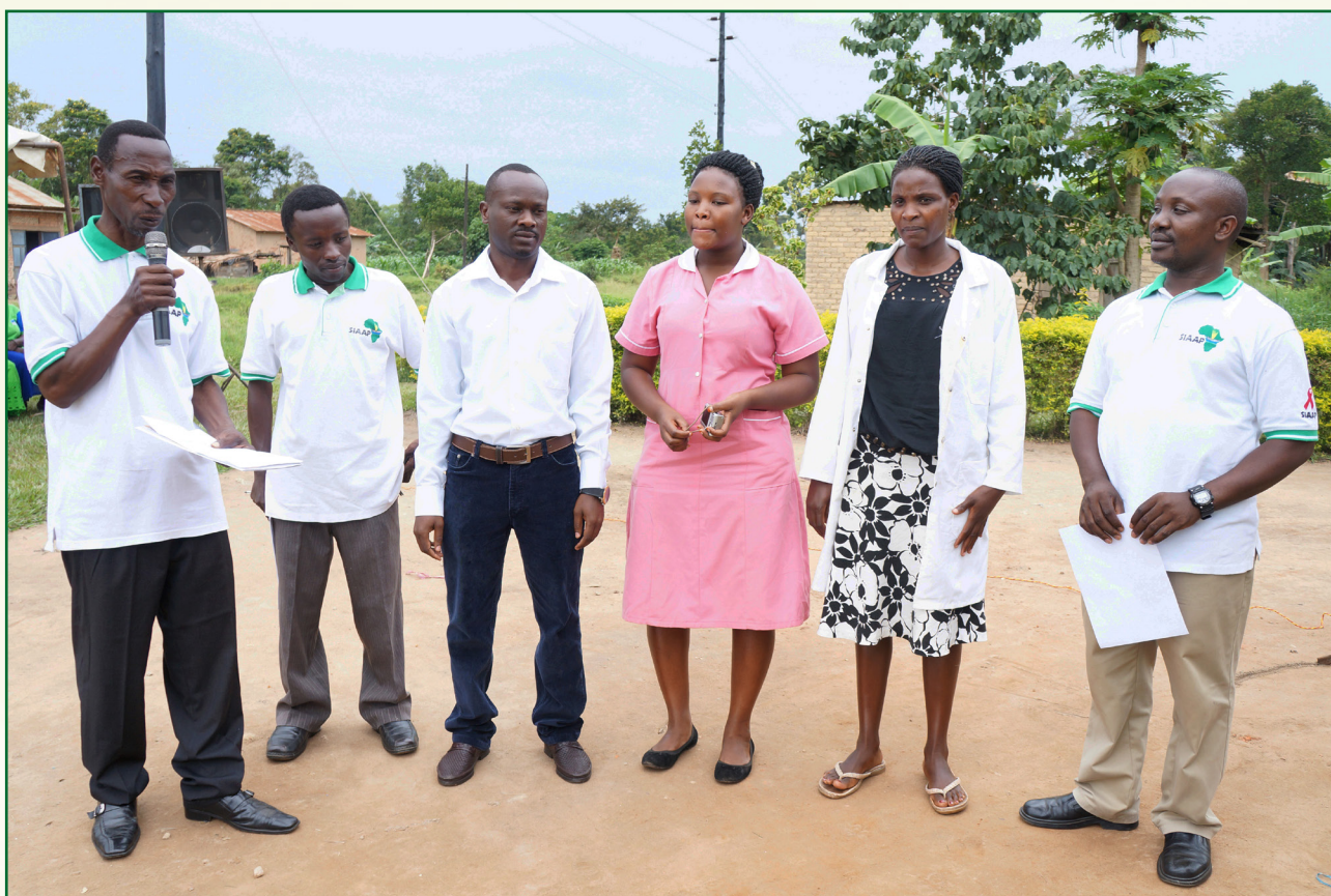
A cross-section of the SIAAP Staff.