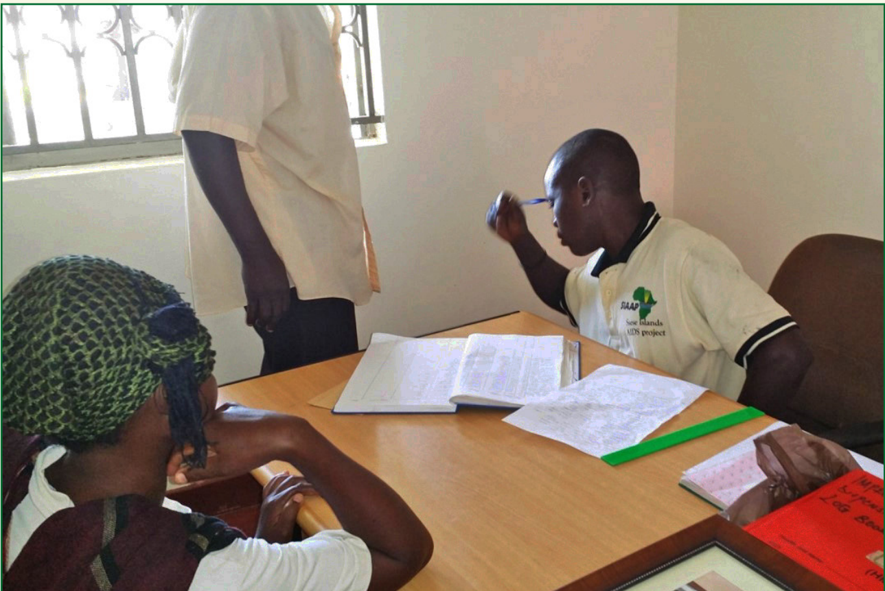
Counseling at SIAAP Headquarters