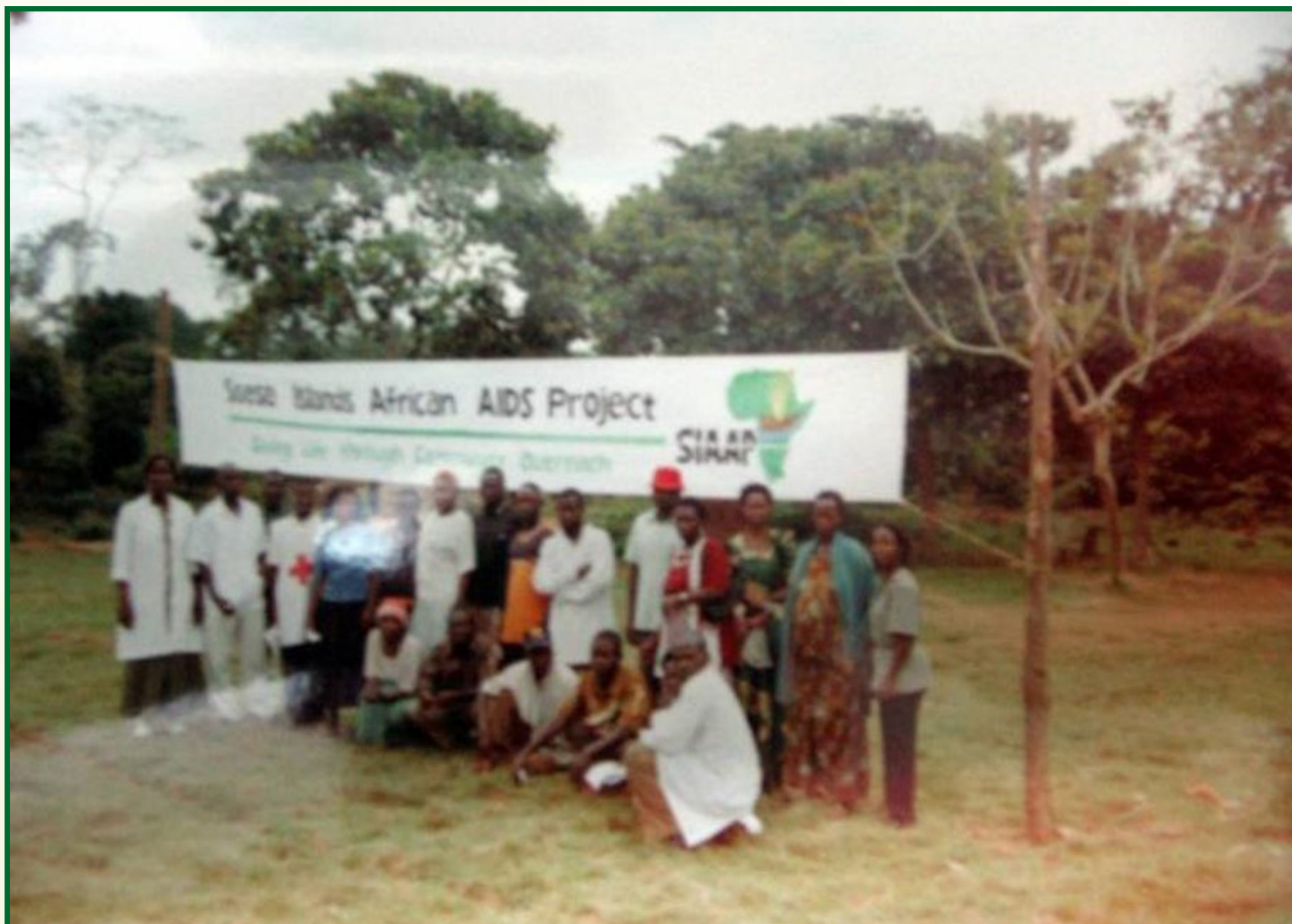
SIAAP opening in 2005