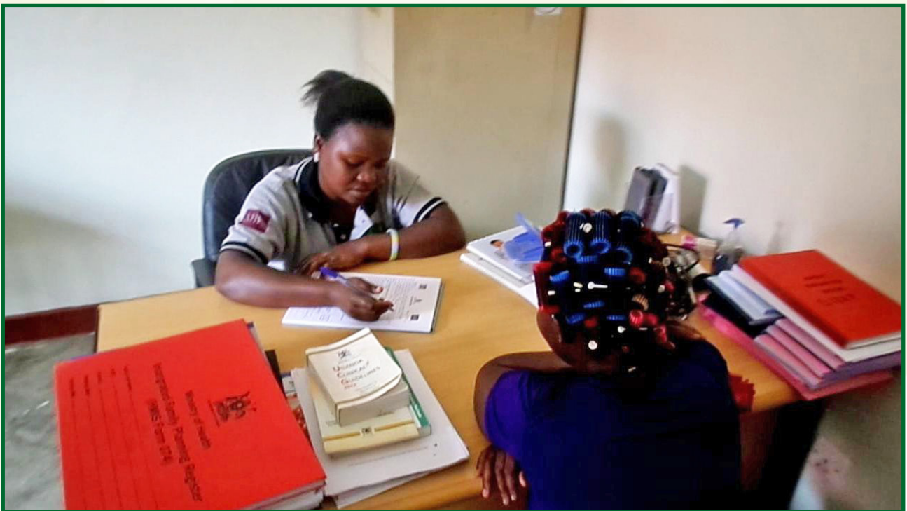
HIV Counseling at SIAAP Headquarters January 2015