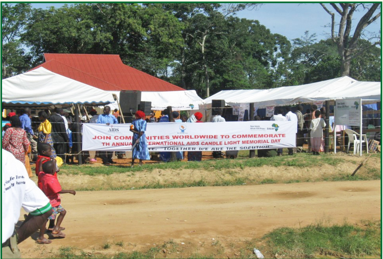
SIAAP HIV AIDS world day celebration at SIAAP Headquarters in 2009