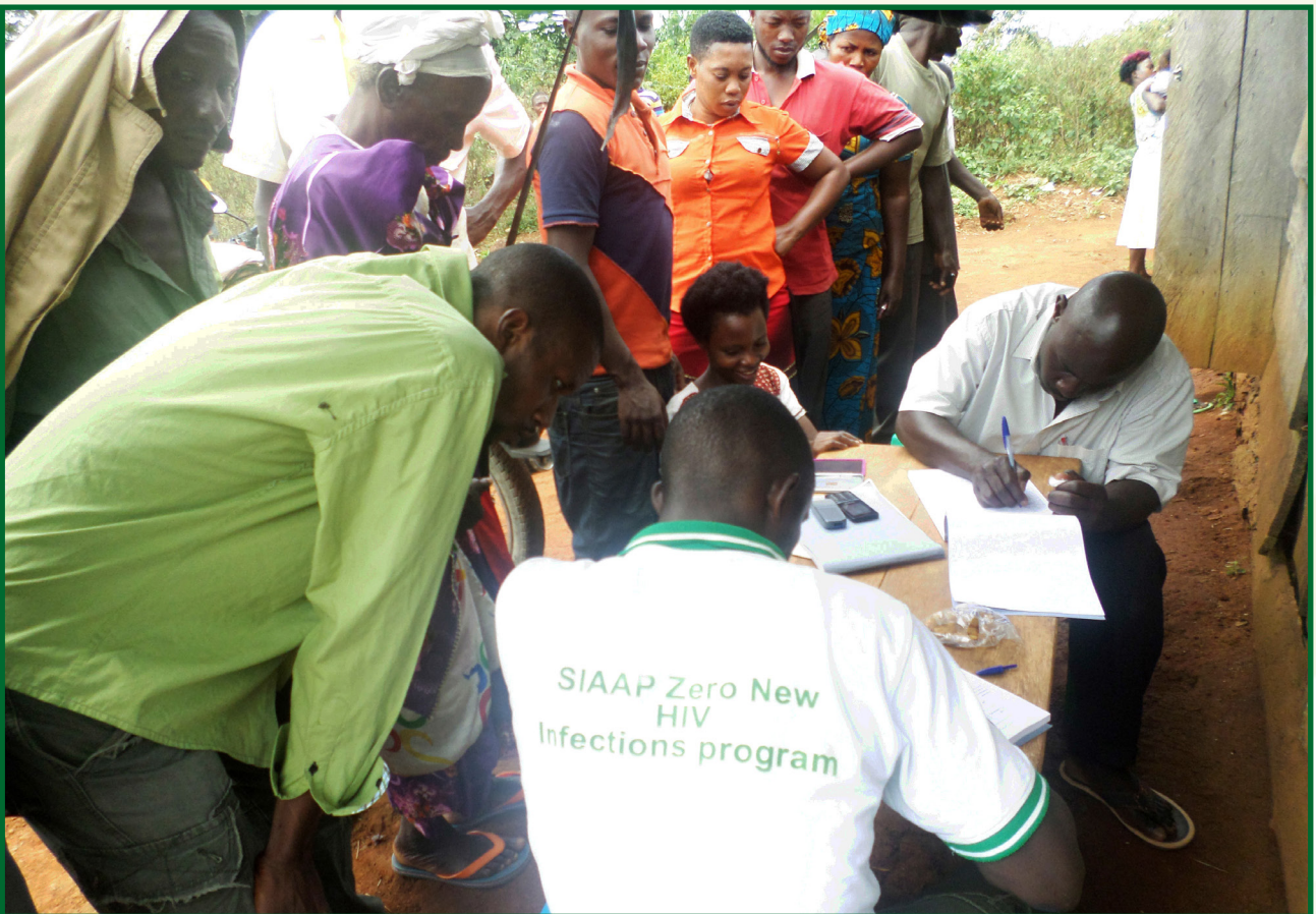
SIAAP carry out Field Outreach Activities to monitor HIV Clients.