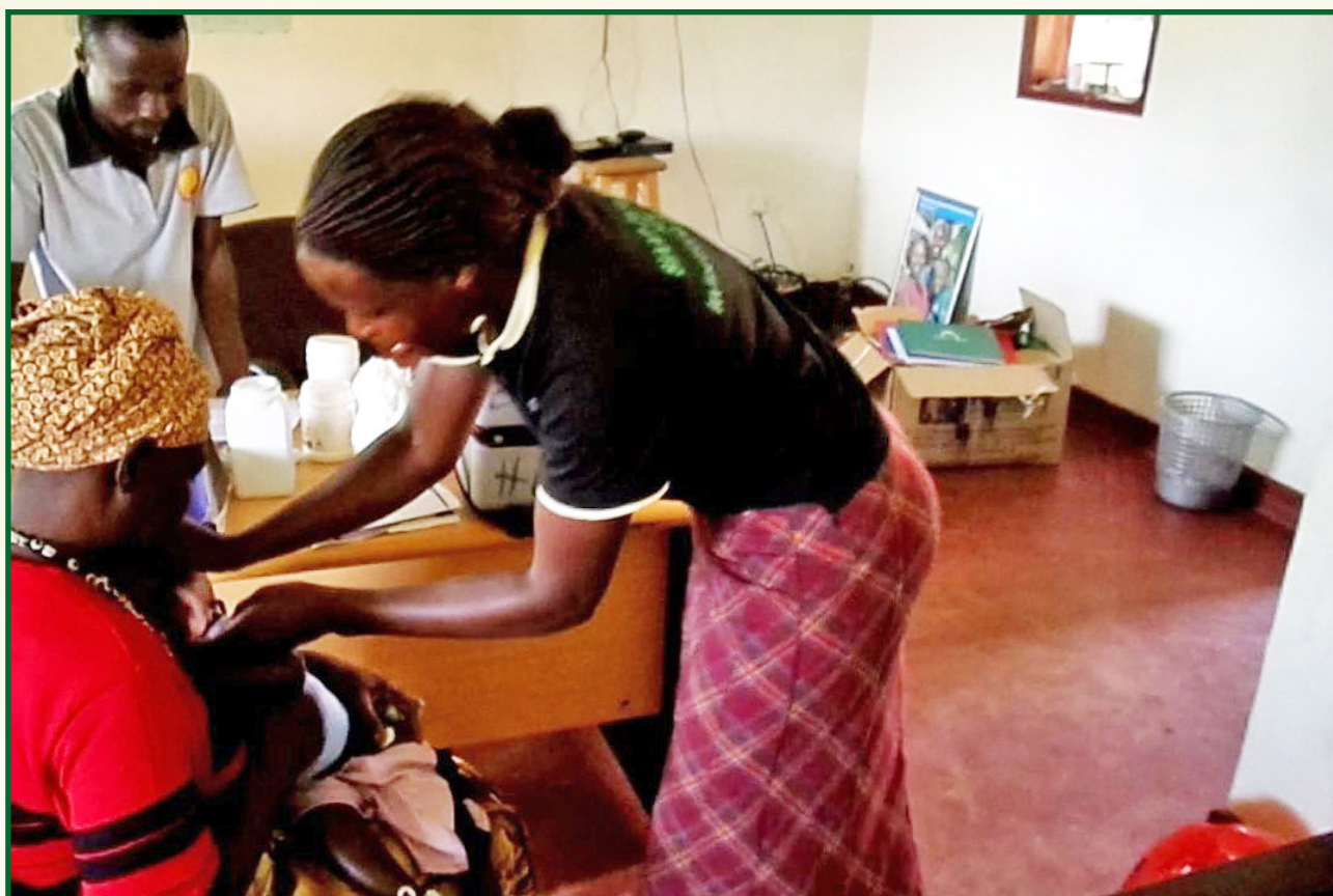
Child Immunisation at SIAAP