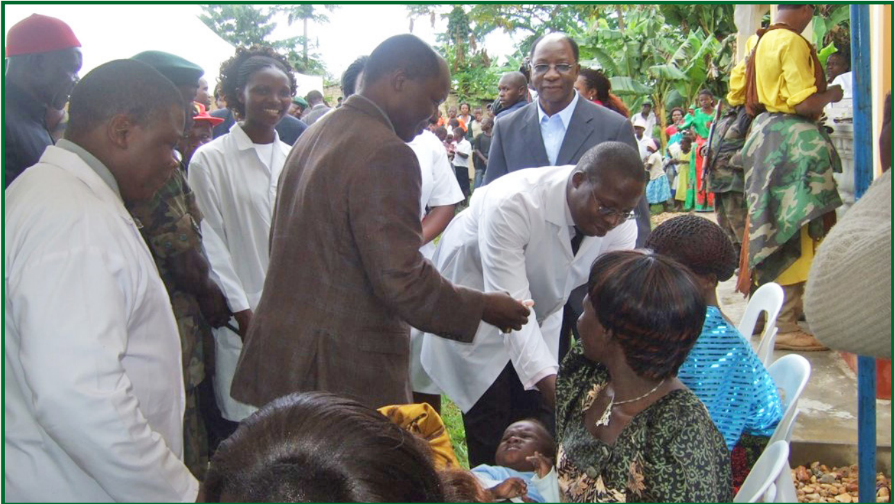
Ssabasajja Launches Bulungi Bwansi immunization at SIAAP Headquarters, OCT 2012