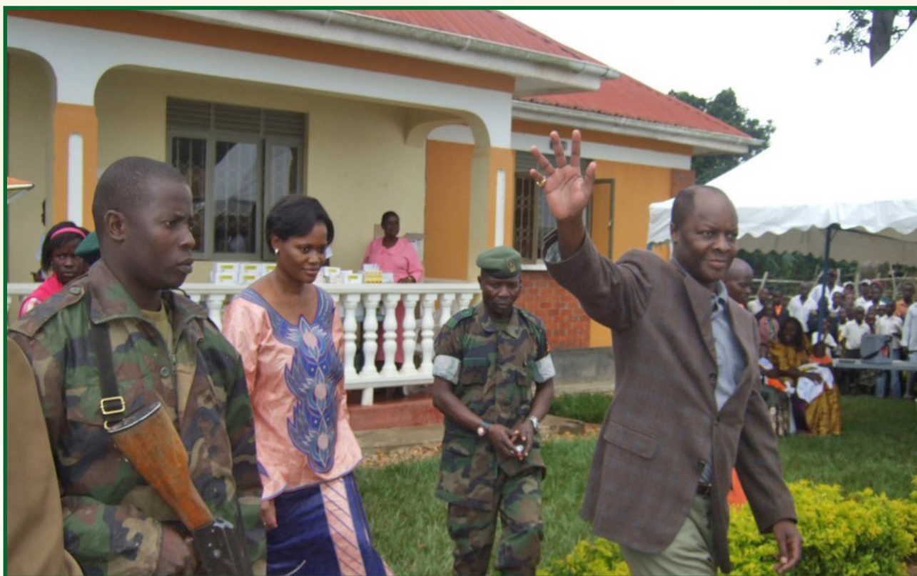
Ssibasajja Kabaka visits SIAAP in 2012