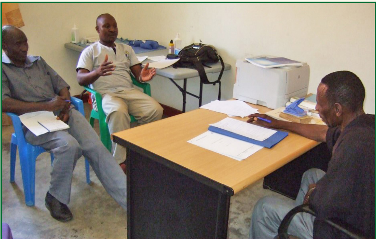
Members of the Advisory meeting at SIAAP Headquarters