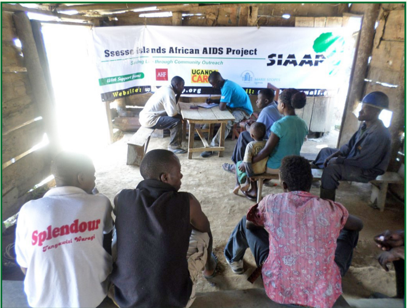
SIAAP Community Outreach at site the fish landing in Kalangala