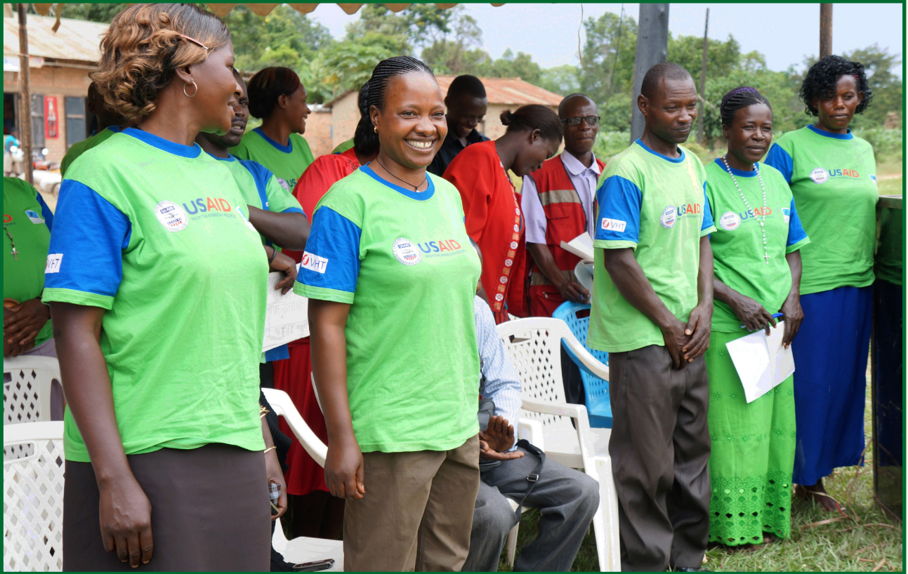
A cross-section of the SIAAP Volunteers